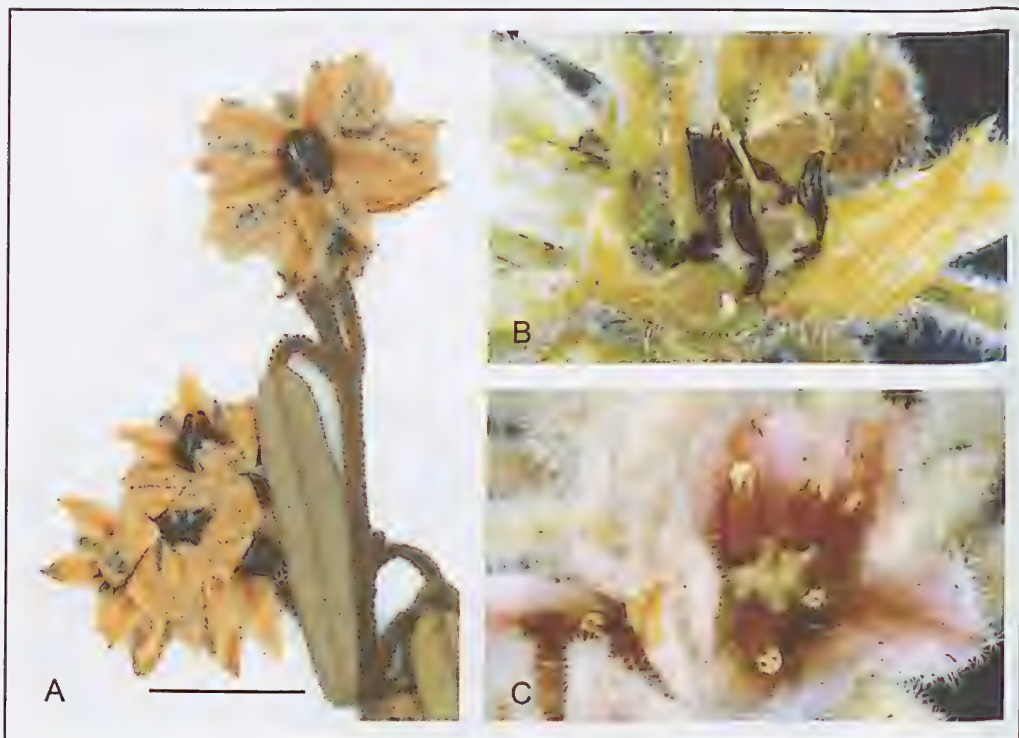
Figure 2. A – Lasiopetalum ferraricollinum , detail of the holotype (K. Kershaw & K. Kerigan 2252) showing the reflexed leaves and compact inflorescence, scale = 1 cm; B – L. ferraricollinum (C.F. Wilkins CW 1427) an open flower with scattered stellate and glandular hairs on the outside of the calyx; C – L. compactum (C.F. Wilkins et al. CW 408) an open flower with tomentose stellate hairs on the outside of the calyx.